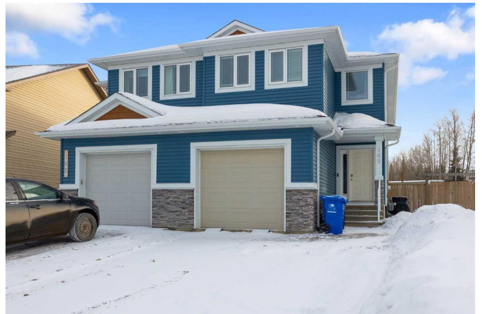
169 Shalestone Way, Fort McMurray, AB

Upstairs, youâ€™ll find TWO primary bedrooms, each with its own ensuite! The main bathroom is a 4-piece ensuite for the second bedroom. Amazing dual function and perfect for guests or a growing family. There is a third bedroom upstairs, also great for