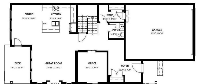
MAIN 1,085 SQ.FT. GARAGE 477 SQ. FT.