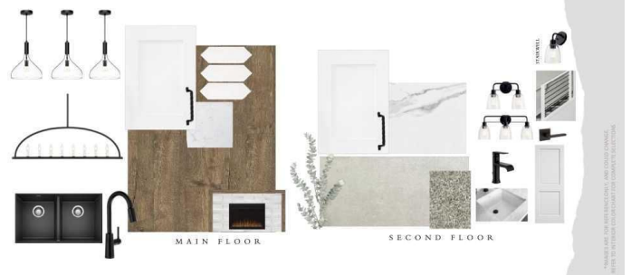
SOUS 005.022 BREEZE-BASEMENT SUITE FINISHES